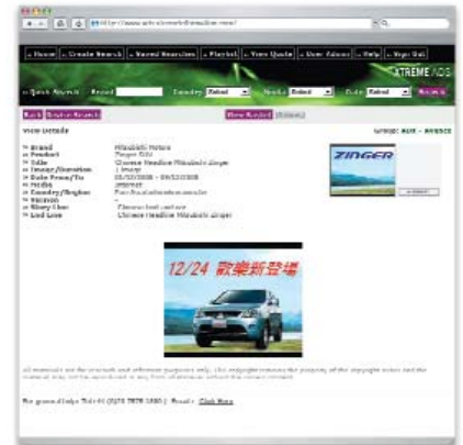
VIEW THE AD ONLINE OR DOWNLOAD IT DIRECT TO YOUR DESKTOP

In addition to electronic delivery, we offer hard copy formats – VHS, U-Matic, CD and DVD.