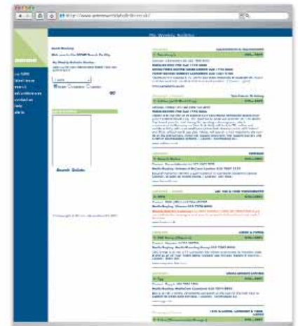
AMMO WEEKLY BULLETIN IDENTIFIES MEDIA SALES OPPORTUNITIES

In addition, the AMMO Weekly Bulletin Hotline service gives exclusive, allows access to an expert team of researchers for individual requests and client briefings.