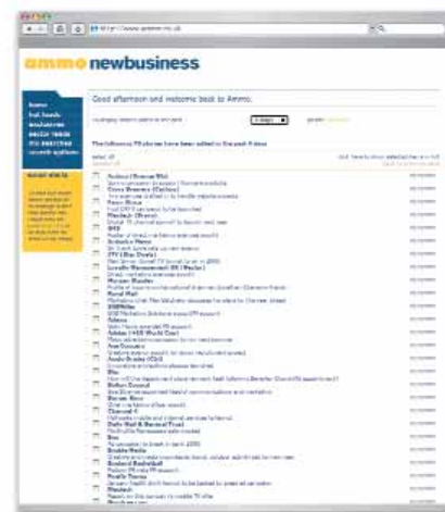
INFORMATION ON UPCOMING CAMPAIGNS AND MARKETING ACTIVITY